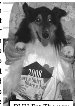
RMH Pet Therapy Dog, Windy

Our 2008 Sport a Shirt, Share a Night campaign was again a great success thanks to all your help! Our Winston Salem Ronald McDonald House sold 6,522 shirts and so far has received almost $17,000 in donations and matching gifts. At this point last year, we reported 6,390 shirts sold and over $10,000 in donations, so we are very excited our numbers are up! We could not have accomplished this without the wonderful support of volunteers. We are very grateful to our House, Family Assistance and Family Room volunteers who generously gave their time to fold shirts, work at booths and gather orders. Thank you!